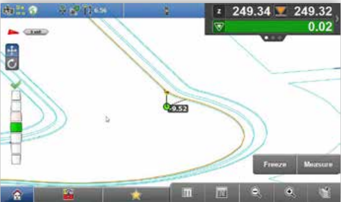
See where you are within the design.